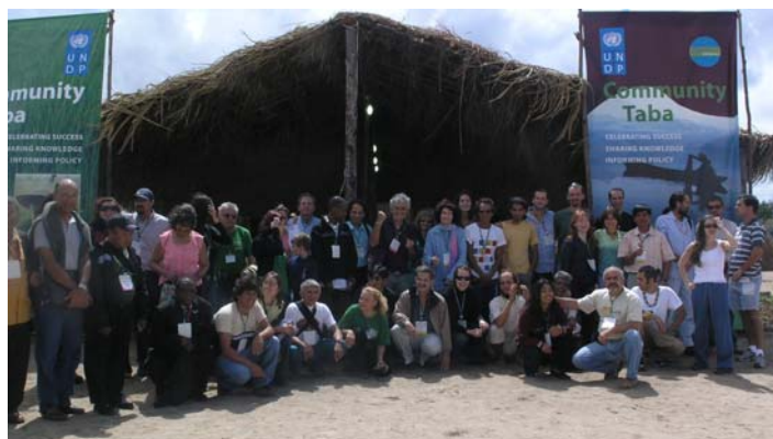
The Community Dialogues were held in an indigenous village setting of huts constructed by the InterTribal Committee of Brazil, next to the main hall of COP 8.

The Community Taba was made possible by the UNDP Equator Initiative and 28 partner organizations, including SwedBio, Wallace Global Fund, GTZ, IUCN-EARO, and Conservation International. The dialogue space was facilitated by grassroots community and conservation leaders and gave all participants a forum for presenting, debating, and drafting ideas to advance their development and conservation agendas at the local and institutional levels, and at COP 8 itself. Official Taba side events included in-depth presentations and Q&A sessions with community project leaders, interactive sessions with government and organization officials attending COP 8, synergistic brainstorming sessions with fellow participants, the crafting of a Community Taba Declaration, a site visit to an Equator Prize winning project, and daily festivities that honored the rich cultural heritage of Taba participants and celebrated the hard work of the group.